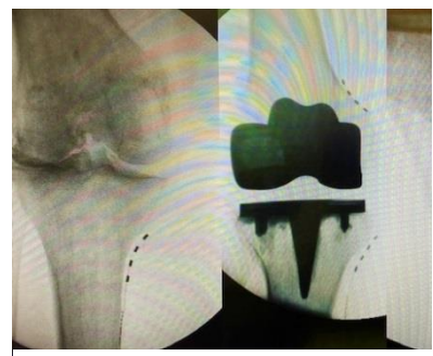
Figure 2. ASIPP 7/2022 PNS TKR

Meralgia paresthetica, a condition involving innervation of the lateral femoral cutaneous nerve to the anterolateral portion of the thigh, as a result of obesity, pregnancy, pelvic masses, external