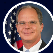
CHAIRMAN HOUSE COMMITTEE ENERGY & COMMERCE BRETT GUTHRIE