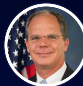
CHAIRMAN HOUSE COMMITTEE ENERGY & COMMERCE BRETT GUTHRIE