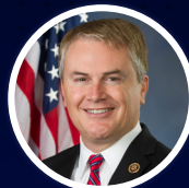
CHAIRMAN HOUSE OVERSIGHT COMMITTEE JAMES COMER