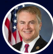
CHAIRMAN HOUSE OVERSIGHT COMMITTEE JAMES COMER