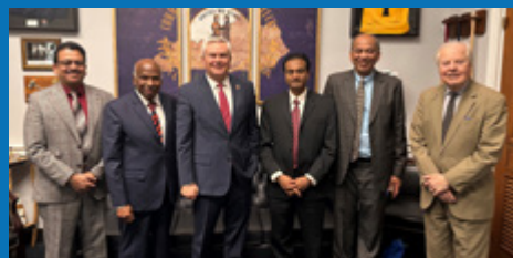
ASIPP with Chairman Comer, 2025