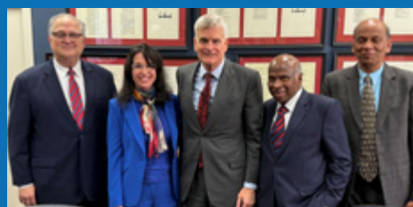
ASIPP with Chairman Senator Cassidy, 2025